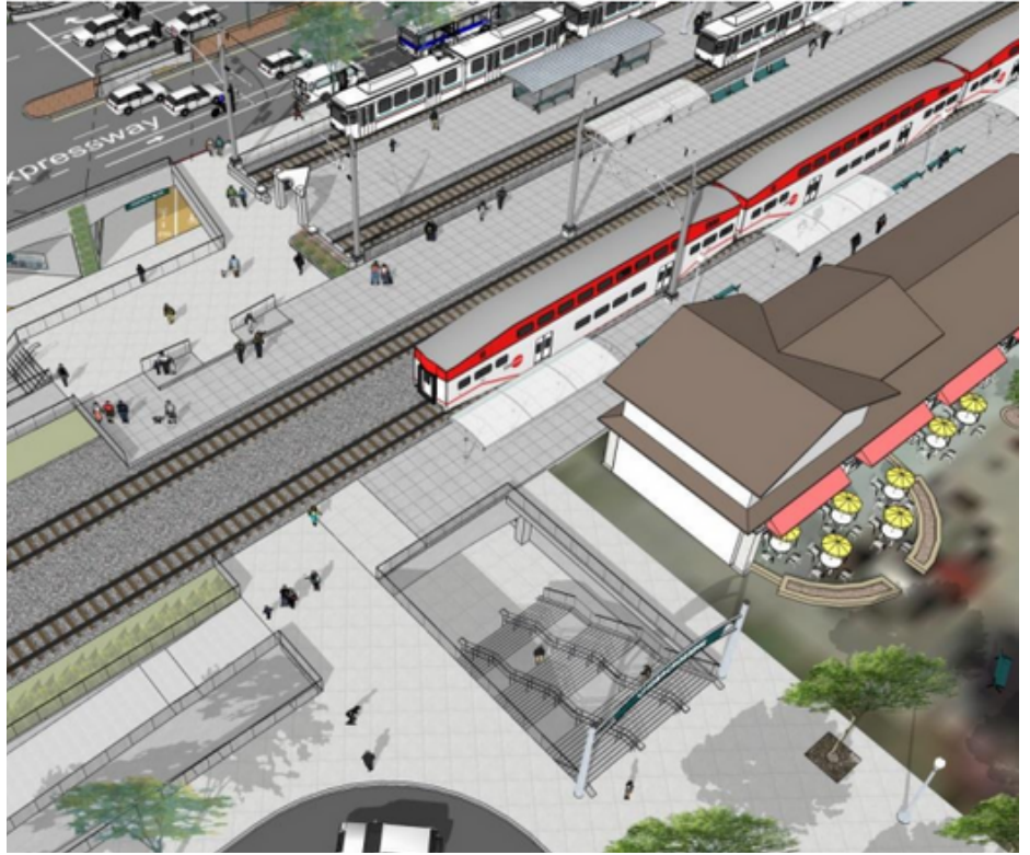
Rendering showing the undercrossing for the Castro Street Grade Separation Project.

The design of this projects is scheduled to be completed in two years, and construction of the Castro Street undercrossings will begin when the project is fully funded. In the meantime, the City will be developing and implementing interim improvements on Castro Street at Evelyn Avenue that will close Castro Street to vehicular traffic at Central Expressway and improve the existing at-grade crossing for pedestrians and cyclists. For more information on the projects, visit MountainView.gov/CastroStGradeSeparation .