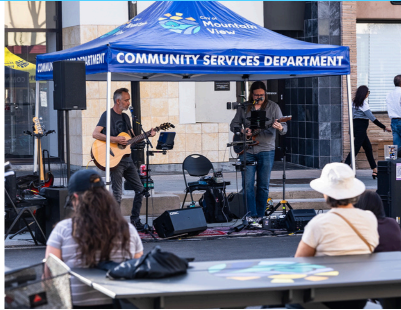
The Music on Castro concert series, like 75% of all City-sponsored events, is held in Downtown Mountain View.