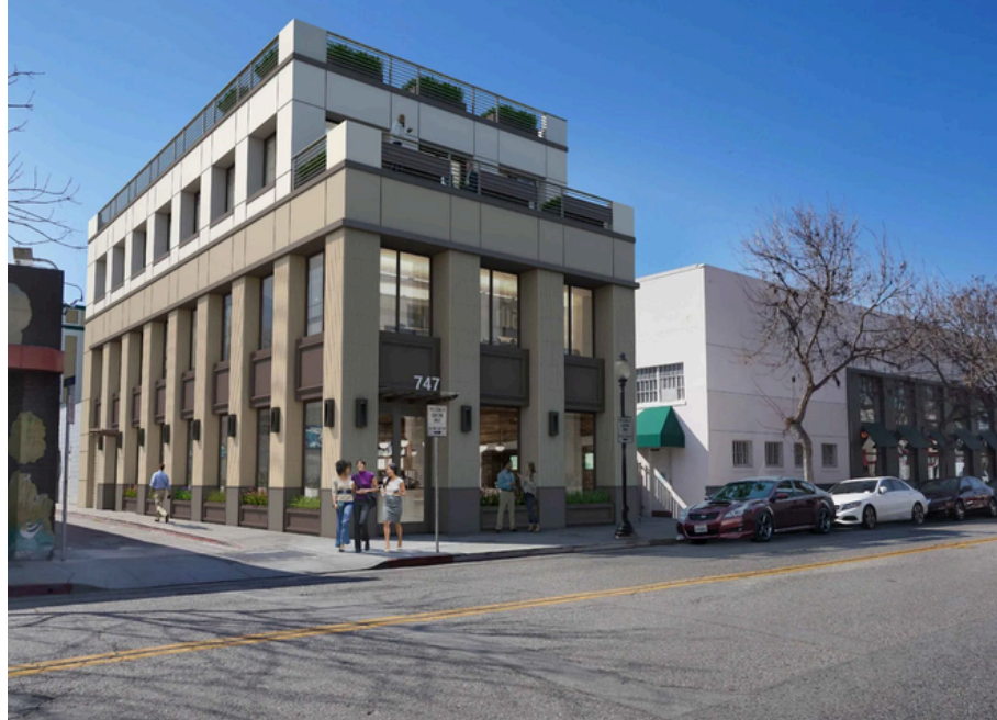
The 747 W. Dana St. project includes the demolition of the existing vacant commercial building and construction of a mixed-use three-story, 8,552 square foot building with office space on the upper floors and a 1,600 square foot ground-floor retail space as seen in the rendering above.

For questions, contact the Community Development Department at 650-903-6306 or community.development@mountainview.gov .